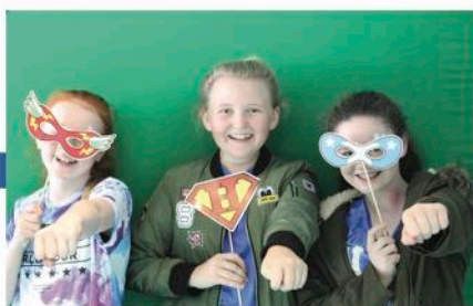
Stand up to bullying photo-Booth

We were overwhelmed with the support from pupils all week at all the events, as well as their participation throughout. Well done to all those involved!