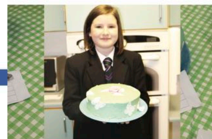
Great New-Bridge Bake Off