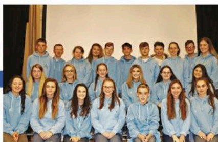
New-Bridge Anti-bullying Ambassador Team 2016