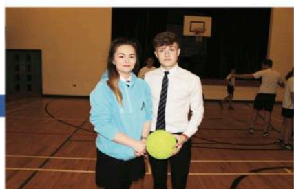
5-a-side Football Club